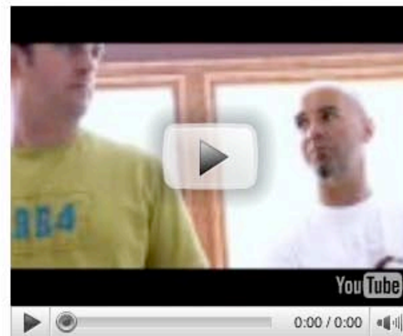
2008 Extra Awards

The Canadian Newspaper Association is the voice of Canada's newspaper industry. We promote the positive reputation of newspapers as an essential medium that benefits all Canadians, and as an effective vehicle for advertisers.